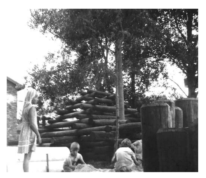
Children playing in the adventure playground at Scarba, 1975

The change to its funding status and the introduction of government subsidies for childcare providers for the care of children under five years allowed the introduction of day care to Scarba. The Society had already taken the view that institutional care for children was a last resort, and day care provided another