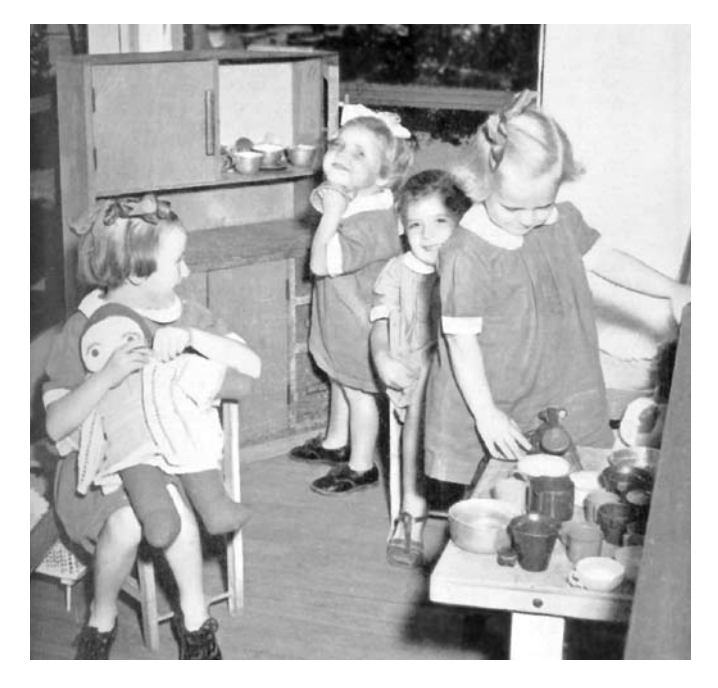
An afternoon tea party at Scarba Home, circa 1952

As Penglase notes, it is important to consider the attitudes of the time; it was assumed that if children received physical care and were socialised into mainstream values, they would lead happy and functional adult lives.<sup>54</sup>