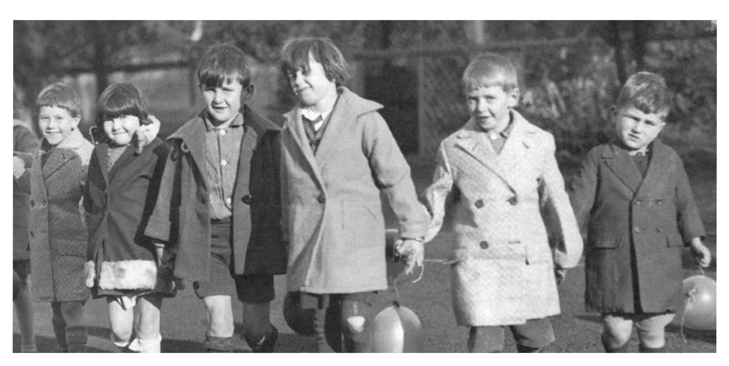
Children playing at Scarba, 1936