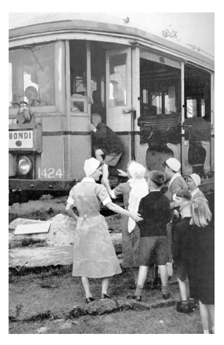
Nurses and children at Scarba watch the installation of a tram car donated by the Transport Department as play equipment, circa 1957

Furthermore, the late 1960s saw the cessation of child migration. The abolition of the NSW Aborigines Welfare Board brought with it an end to the assimilation practice of systematically removing Aboriginal children from their families. However, Indigenous children are still over represented in both the child welfare and criminal justice systems.86 In the early 1970s a recognition of the social inequalities faced by Indigenous people led to the establishment of Aboriginal childcare agencies. Aboriginal people were included in decision-making processes affecting Aboriginal children and those in need of substitute care were to be placed with their extended family or within their own community.87