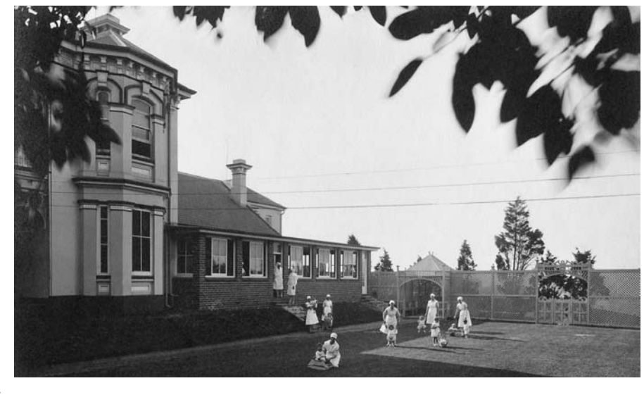
Children playing outside Scarba Home, 1928

Despite the late 19<sup>th</sup> century recognition of the value of the family, which was reflected in social policy, care practices in Australia have tended to replace the family with out-of-home care, rather than provide the support needed for a child to remain at home. In 20<sup>th</sup> century NSW, the majority of State wards were removed into foster care rather than institutions, however hundreds of institutions both government and non-government existed. The non-government institutions housed children placed by their parents in times of crisis and hardship; the government institutions housed State wards.