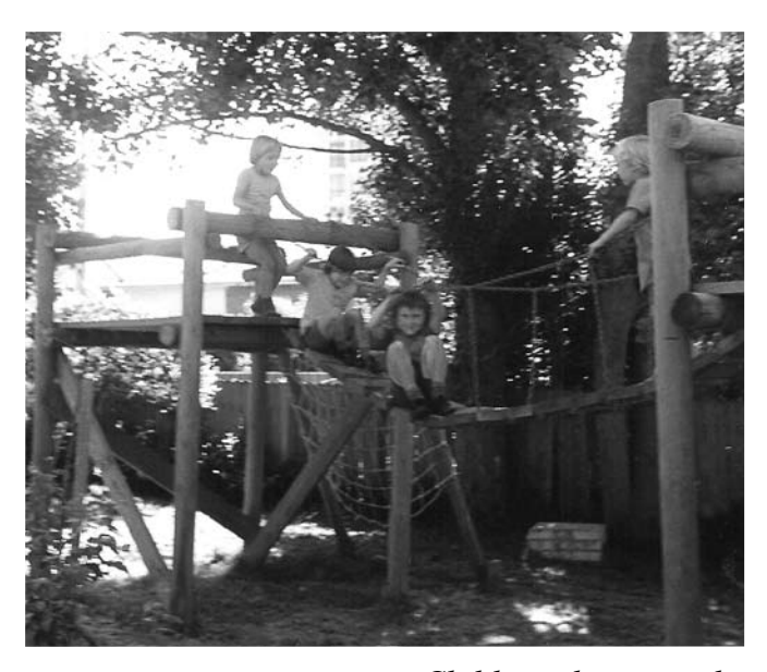
Children playing in the adventure playground at Scarba, 1975

The trauma children experience on being institutionalised was now recognised and family group care was seen as a way of minimising this.