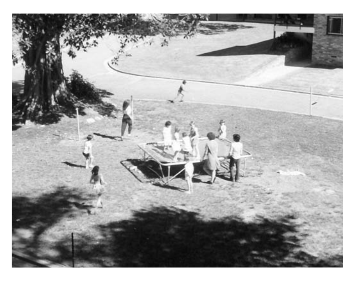
Children playing on a trampoline outside Scarba House

After-school care had now been running alongside the residential care at Scarba for