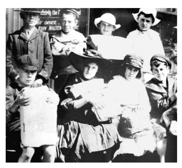
Children receiving outdoor relief parcels, 1906

In 1917, when Scarba House was opened as a residential care facility, The Benevolent Society was already over 100 years old. The Society had concerned itself with what were considered to be the burning social issues of the 19<sup>th</sup> and early 20<sup>th</sup> centuries, and had concentrated on such activities as providing 'outdoor relief' and accommodation for those in need, including at the Benevolent Society Asylum which operated from 1821 to 1901 on the site of what is now Central Railway Station. The Society had always focused on providing services for women and children.