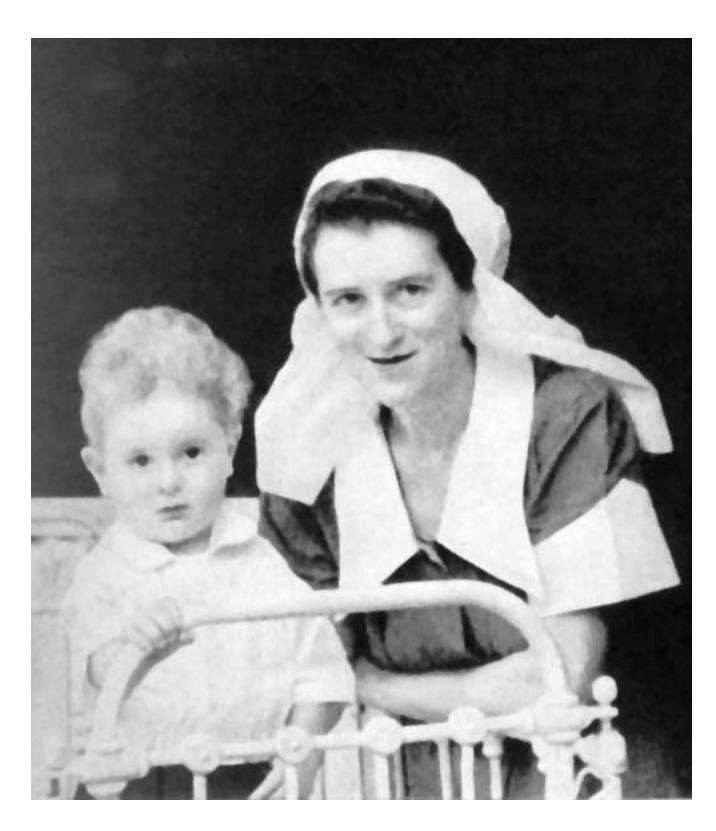
A child at Scarba Home, circa 1951