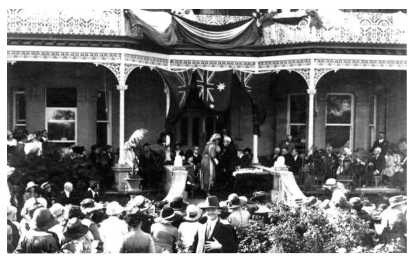
The official opening of Scarba Home, 26 September 1917

The infants were usually taken to the Society's Renwick Hospital for Infants for medical care, before being returned to Scarba. <sup>58</sup> While no reasons for the large number of these children being found in the early years are given in the records, it can be assumed that many were illegitimate births, a situation that carried great stigma at this time (and arguably until the 1970s). Others may have been born to women widowed in World War I, who found they were unable to care for a child on their own, especially in an era before child endowment or widows' pensions (introduced in NSW in 1926 and 1927 respectively). <sup>59</sup>