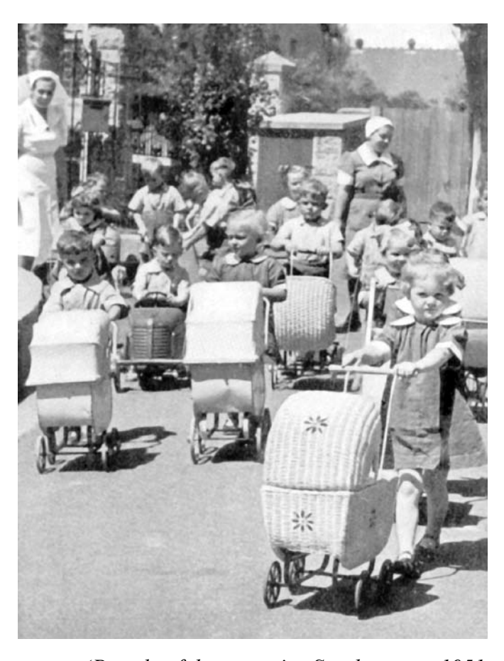
'Parade of the prams' at Scarba, circa 1951

early and mid 20<sup>th</sup> century. From our current viewpoint, care practices can seem harsh and difficult to understand, as can the sheer number of children who experienced out-of-home care. However, we must view this in the context of the attitudes and realities of the time, such as the lack of social security provisions and alternative services for families in crisis.