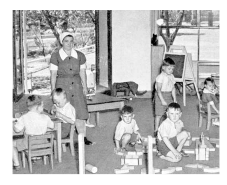
The kindergarten at Scarba, 1951

The past 40 years has seen a dramatic change in what is considered acceptable child welfare and childcare practice. From the 1950s, developments in psychology radically altered parental advice and drew attention to the