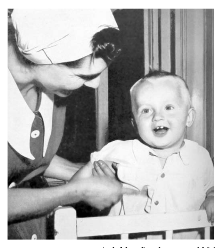
A child at Scarba, circa 1956

were generally not allowed to keep their own toys, "...because [of] the possibility of them being lost or destroyed by the large number of other children." It was felt that the children's access to communal toys would alleviate their need for personal items. This highlights a lack of understanding of the emotional needs of children and a pragmatic view of care: the difficulties presented by the possibility of a lost toy were seen as outweighing the child's need for attachment and a sense of familiarity and safety.